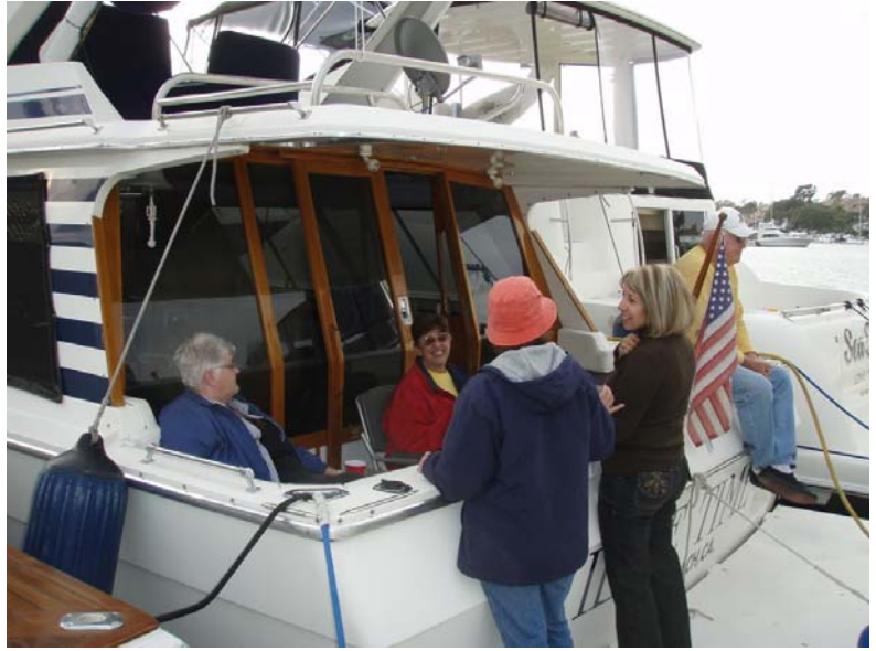
Cruiser veterans, BCYC 2009